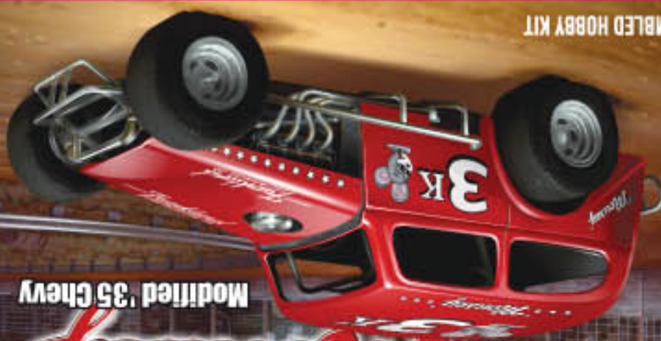
Modified '35 Chevy